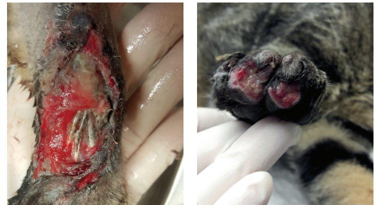
Fig. 1 and 2 Moritz at the first presentation on July 5, 2017.

Then they applied bandages, which were changed every two days, initially while sedating Moritz. Later, they were able to change the bandages without sedation.