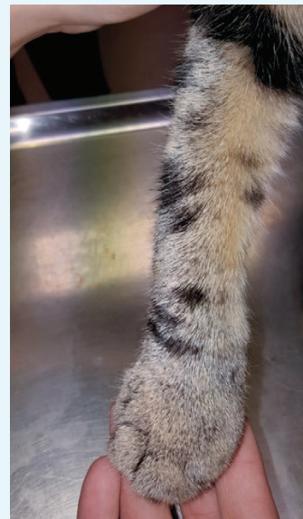
Fig. 8 September 7, 2017 checkup.

The wound is covered with a film through treatment with Episanis BioHAnce Skin and Wound Gel. This method can heal small to large wounds. In this case, it took six weeks for the injury to heal completely without using additional drugs.